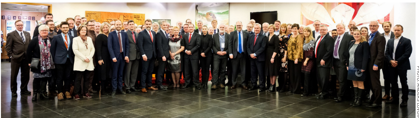
Delegates to SAMAK's Annual Meeting January 15 2016 at Rönneberga outside Stockholm, Sweden.