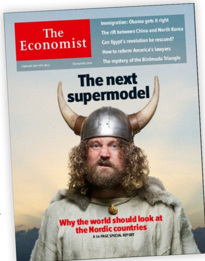
Front page of The Economist, February 2nd 2013.