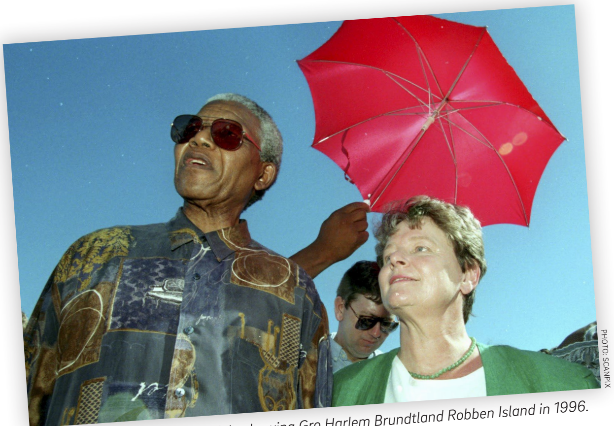
Sharing outlook: Nelson Mandela showing Gro Harlem Brundtland Robben Island in 1996.